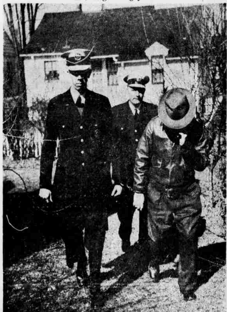
APPREHENDED because of teamwork within the police department and between a fast-thinking citizen and alert officers.