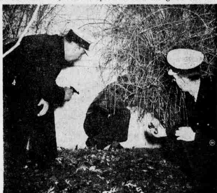
WHILE MORE police converge on the neighborhood, Fieler and Elbert spot their quarry cowering in a clump of bushes in a neighboring yard.