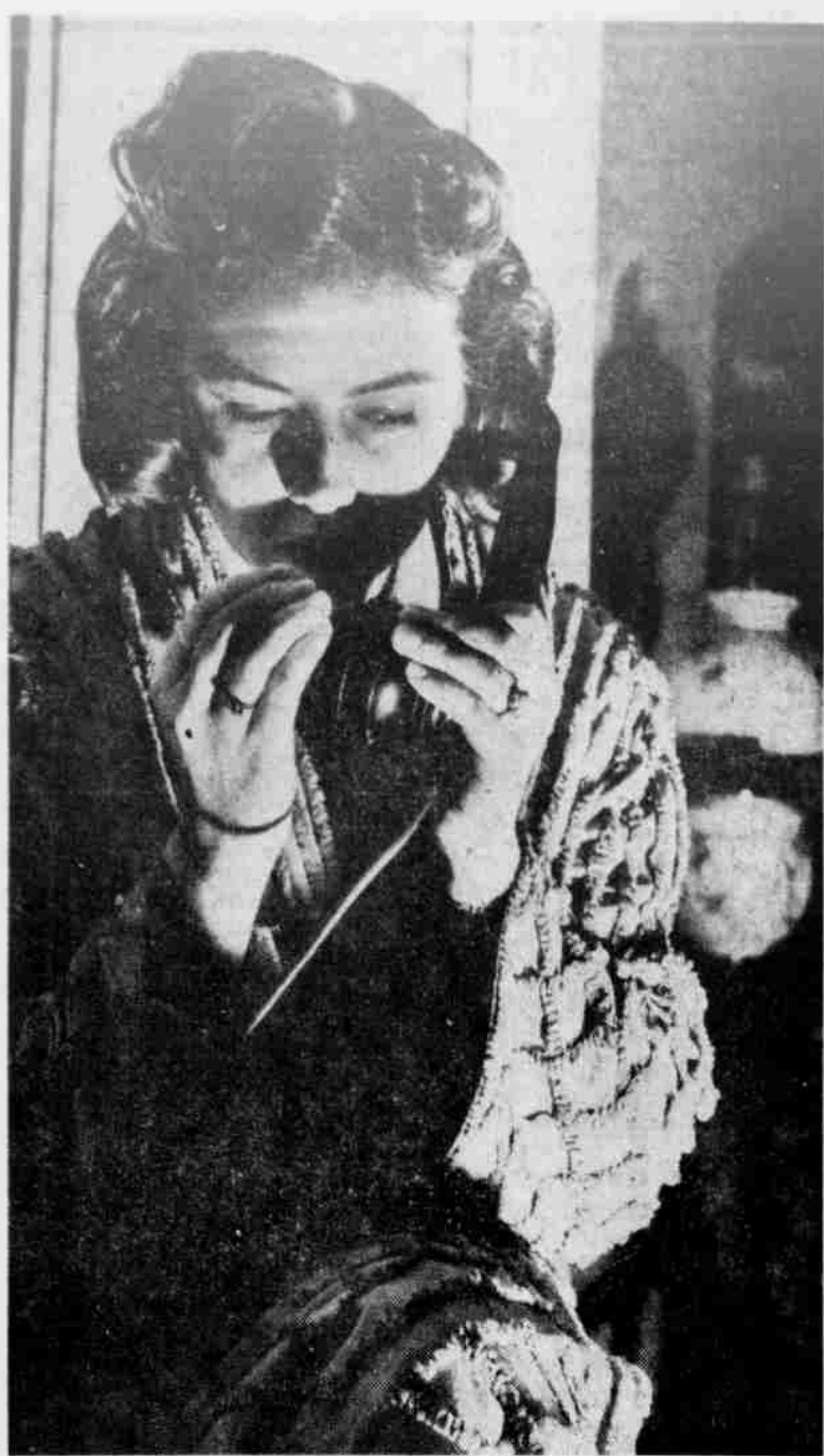
AROUSSED from bed by the noise, the frightened lone occupant of the house has the presence of mind to call Station X. She whispers her address.

Although the events depicted normally occur at night, the photographs were posed in daylight for the sake of clarity in detail.