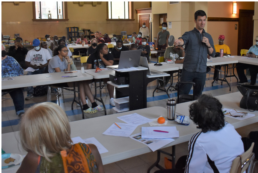
Residents of the Beekman Corridor contribute local experiences of climate change and potential solutions.

Another key mechanism for “including” was the Climate Safe Community Series. This series, an adaptation of the Climate Safe Neighborhoods effort, allowed Groundwork Ohio River Valley, Green Umbrella, and the Office of Environment & Sustainability to pilot an approach for residents of priority communities to share their neighborhood-level expertise, craft a vision for their community, and provide recommendations for the 2023 GCP. Across four sessions during the summer of 2022, more than 225 residents of 11 priority communities gathered to engage and share their lived experiences. All attendees were compensated for their time and received child care, if needed. Nearly 300 ideas were shared to improve the sustainability, equity, and resilience of these priority communities. All were given consideration in the development of the goals, strategies, and actions that came forth in the 2023 GCP.