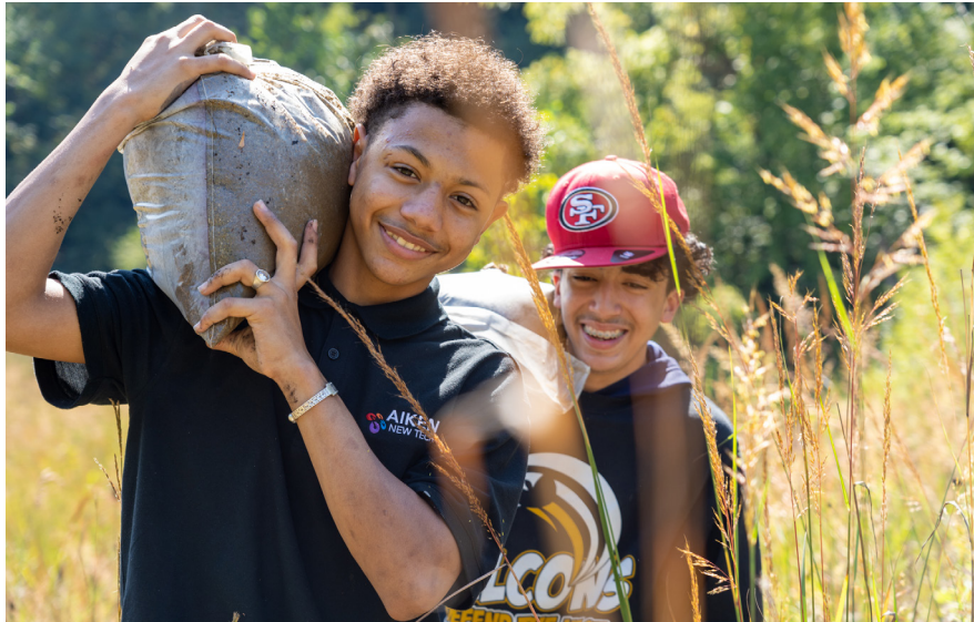
Aiken High School students learn by doing in their agriculture program.

At the printing of this report, the best available resources for GCP implementation partners to consider “where?” and “for/with whom?” efforts should be targeted to enhance equity include the following: