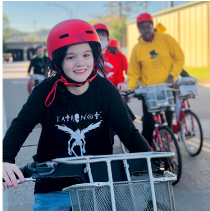
A group of youth enjoy a ride on a local trail

As the City works to operationalize the climate equity strategies of the GCP, a common language and approach to prioritizing communities hit first and worst by the climate crisis is needed. In climate equity work, communities are referred to by many different terms—frontline, disadvantaged, under-resourced, minority, low-income, and more. In this Plan, the term “Priority Communities” is used to communicate the essence of these various terms, and