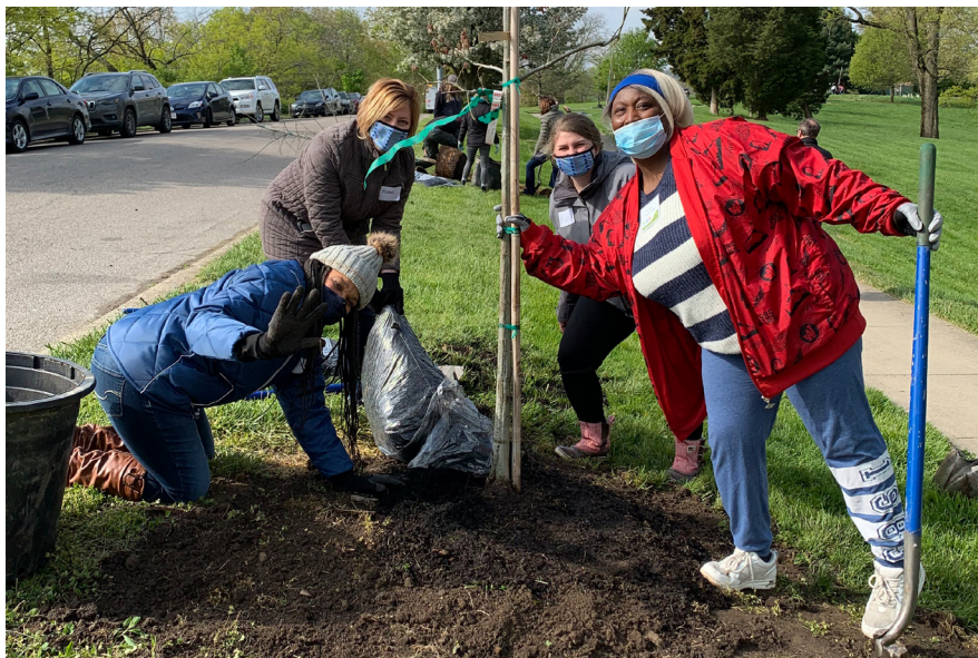
Volunteers conduct spring planting in Mt. Echo Park.

The Green Cincinnati Plan (GCP) Equity Framework is an evolving guide to support integration of equity in the climate action planning and implementation process. It is an evolving tool because we continue to learn and adapt—the process of integrating equity is iterative, not linear. Cincinnati is on a learning journey toward climate justice. This piece’s aim is to document a vision for equity for the Green Cincinnati Plan and to support all involved in implementing the GCP with a common vision and language as we all work to intentionally navigate this complex territory toward purposeful and accountable action.