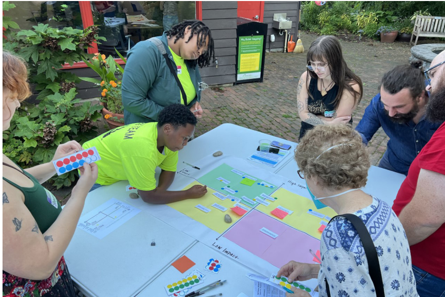
Local residents discuss and contribute ideas in a community meeting fall 2022.

By utilizing the established commitment, common language, engagement strategies, and tools for integration, every attempt was made to weave equity into the process as well as development of the Vision, Goals, Strategies, and Actions that make up the crux of the Plan. While not perfect, these efforts and those still to come will evolve as the GCP comes to life.